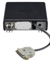
Optional OPC-2078 installation image